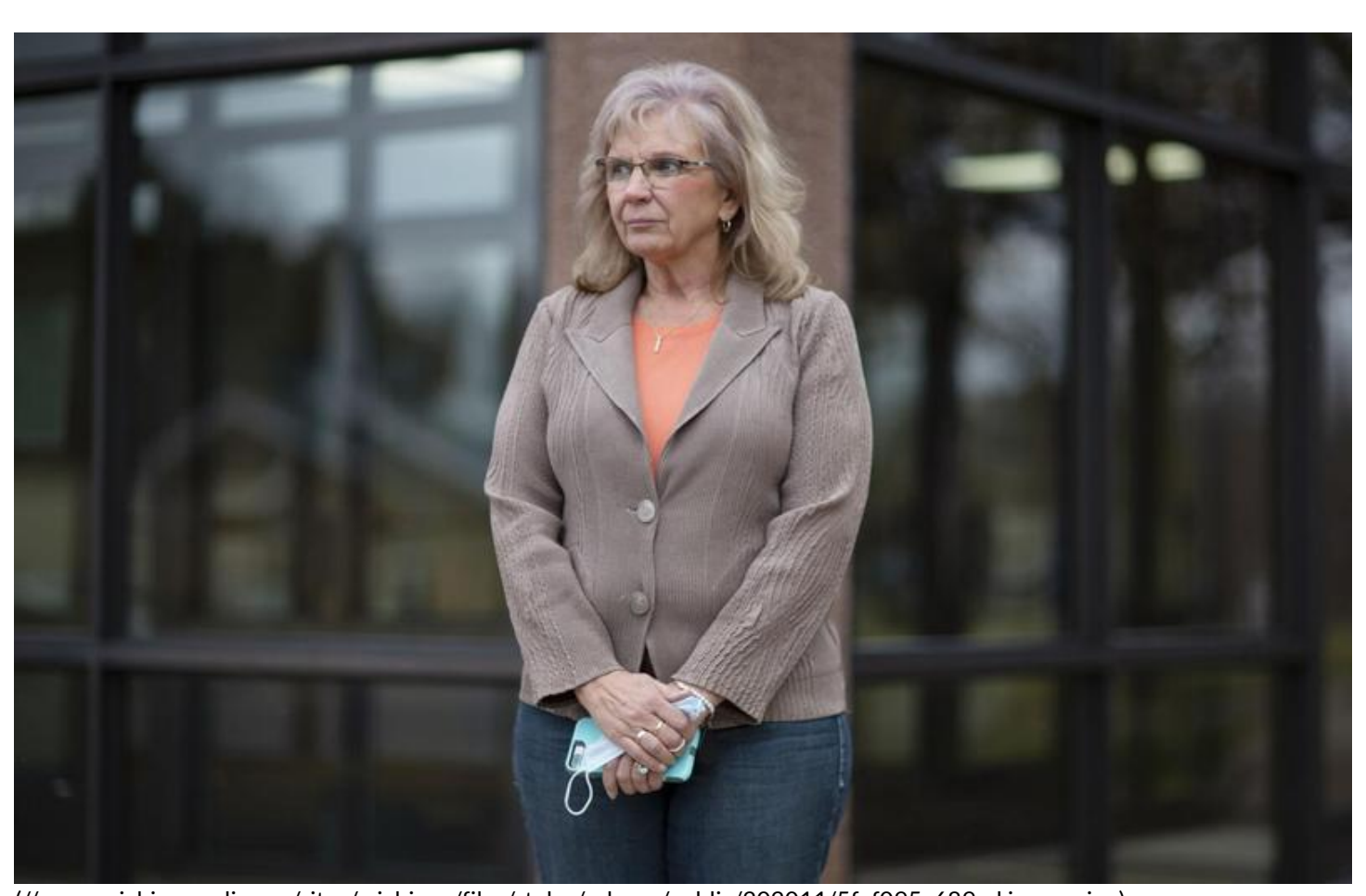
(//www.michiganradio.org/sites/michigan/files/styles/x\_large/public/202011/5 faf 095 c 689 ed.image\_.jpg)

u=https%3A%2F%2Fj.mp%2F3pGUF1s&t=Disinformation%20agents%20were%20watching%20and%20waiting%20to%20exploit%2