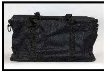
Image 2: Black canvas bag used to transport and temporarily store Election Day ballots.

The ballots were delivered to the Senate in sealed boxes, not bags as stated by Senate President Fann’s letter. To comply with legal requirements (A.R.S 16-608 and Chapter 9 of Elections Procedures Manual 1 ) the Elections Department provides poll workers with black canvas bags (see Image 2 below) and tamper evident seals (see Image 3 below) to return Election Day ballots that were voted and tabulated onsite at a voting location. The poll workers, in bi-partisan teams of two or more, delivered the ballots to the Election Department in the bags affixed with a tamper evident seal on election night.