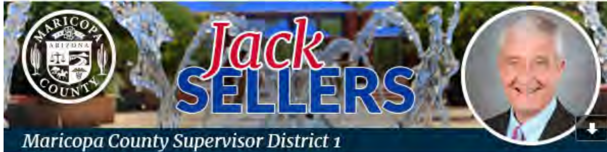
Exhibit A-1 – Official statement released on May 7, 2021 from the Maricopa County Chairman of the Board of Supervisors